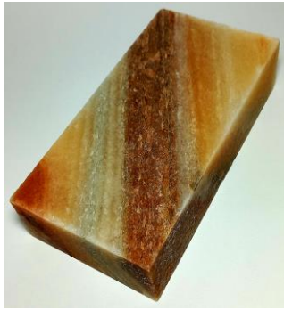
Salt Block Modle A20105

Salt bricks or blocks are used to build salt structures. The rocks of industrial salt are transported to the factory after being extracted from the mines by explosive operations, where they are cut into salt blocks. These blocks have a very high density and also due to the existence of complexes of intermediate elements, they have a high color variety and can be seen in white, pink, crimson, brown, red, green, gray, etc.