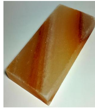
Salt Block Modle A20103